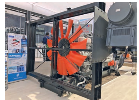
Horton HTEC fans are engineered to tackle environments where durability and airflow requirements can prove challenging, the company says

Béni Amir), three in Gantour (Benguérir, Bouchane and M'Zinda) and one in Boucraâ. The MRC will be based at the heart of OCP Group's industrial ecosystem, within the Fertiparc of the Oued Zem complex, Cummins said.