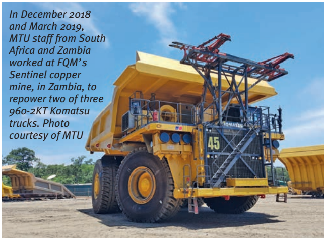
In December 2018 and March 2019, MTU staff from South Africa and Zambia worked at FQM's Sentinel copper mine, in Zambia, to repower two of three 960-2KT Komatsu trucks.

this purpose. “These are pre-assembled drive modules consisting of an engine, a generator and a radiator all mounted on a base frame. They also come with an electronic engine management and monitoring system,” MTU said.