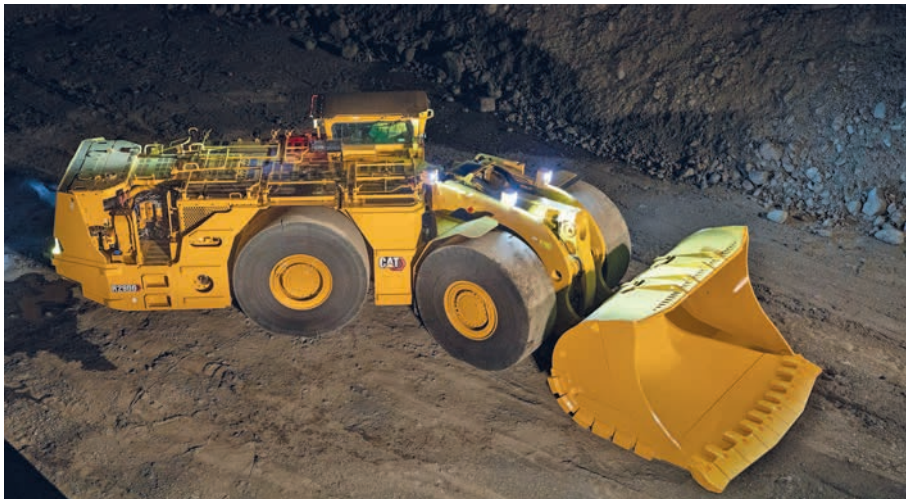
Cat's recently launched R2900 underground loader is equipped with a six-cylinder, 305 kW-rated C15 engine, which uses the Cat Clean Emissions Module to limit both PM and NOx to near zero

These three companies went around their product development in similar fashions to deliver the emission-compliant engines.